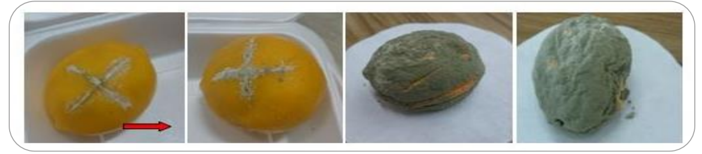
Figure 1. The experience of the Penicillium italicum on lemon fruits, the formation of Blue spores giving it the distinctive Blue color of the disease.

Test of the pathogenic ability of the fungi P. italicum: The results showed that the isolate of P. italicum, of the affected lemons (Figure 1), was highly pathogenic to the healthy lemon fruits. The symptoms of the infection on healthy fruits was appearance after 3-4 Days of inoculation with P. italicum. The progressive development of white growth formation surrounded by water layer and then the formation of blue spores giving it the distinctive blue color of the disease and covered by the fruits in full and in the end shrinking, rotting and decomposition of the fruit.